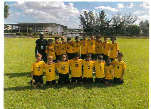
Boys' Soccer Team: Pictured Above