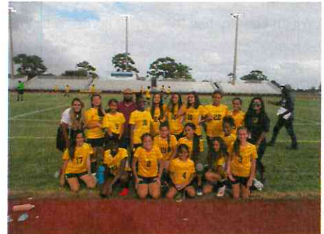
Girls' Soccer Team: Pictured Above